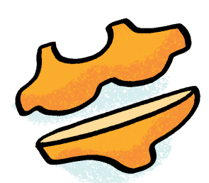
a swim suit