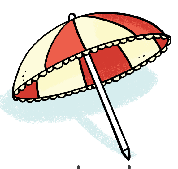
a beach umbrella